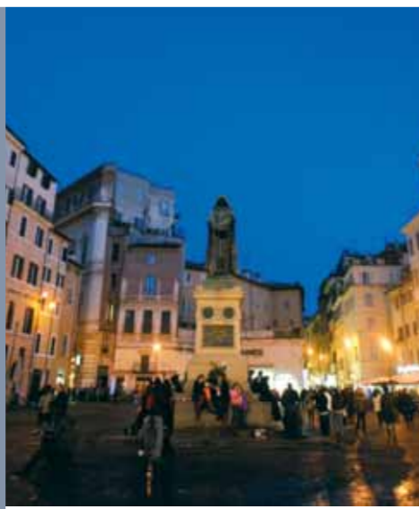
Campo de' Fiori

Feeling satisfied with these discoveries, and with our pockets a bit emptier, we